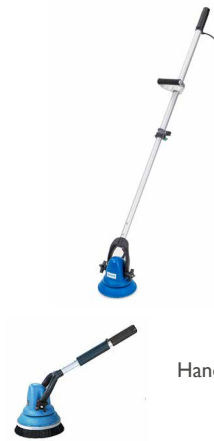
Handle 38 cm hand held solid