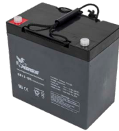
12V 55AH BATTERY