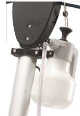
SPRAY SYSTEM KIT